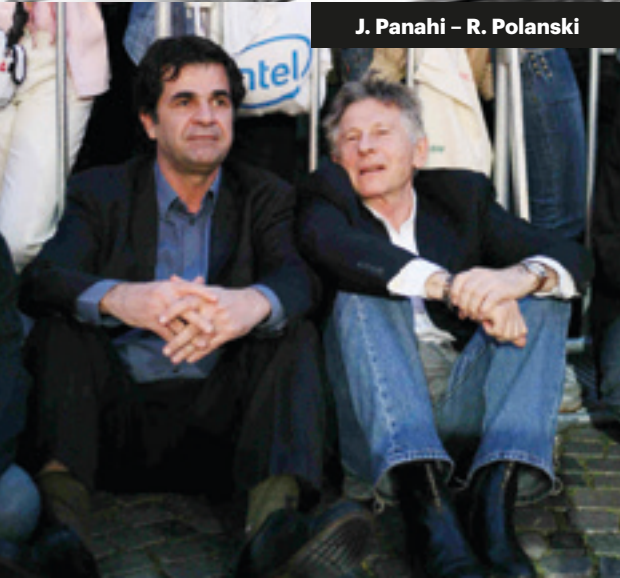
J. Panahi - R. Polanski