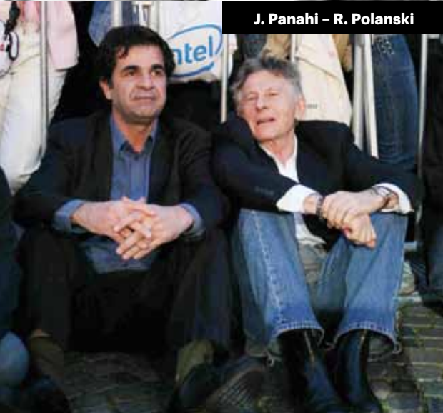
J. Panahi - R. Polanski