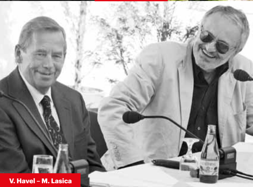
V. Havel - M. Lasica